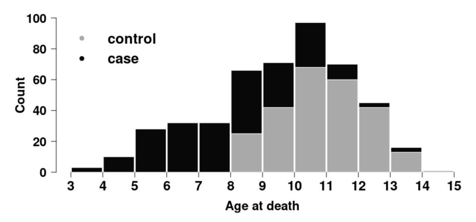
Figure 1. Distribution of age at death in 220 OSA-affected cases and 251 OSA-unaffected controls in Leonbergers.